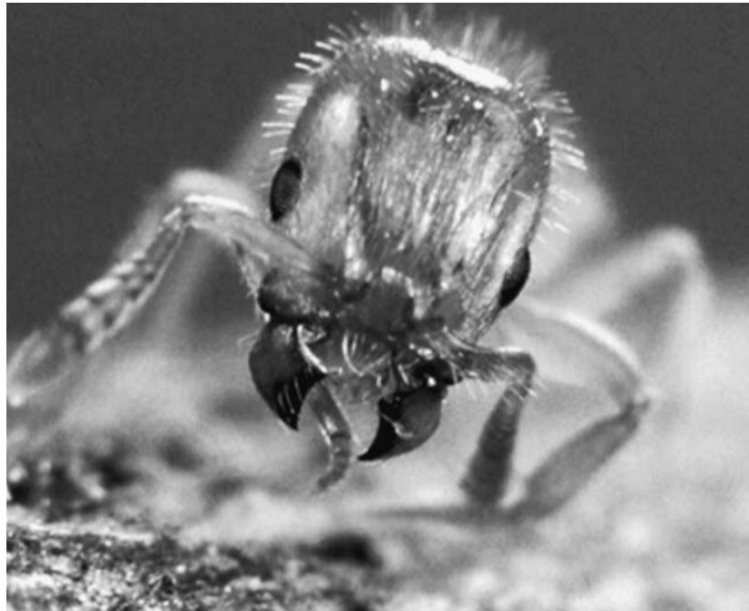
Fig. 2. Detail of the head and mandibulae of Harpagoxenus sublaevis.

authors suggest that the species is an ice age relict (“nacheiszeitliches Relikt”) because of its boreal-alpine distribution. In France the species is only known from the Pyrenees and the Alps (ANONYMUS, 2006). The new record from the Hautes Fagnes might be seen in this boreal-alpine context. However records from lowlands in Niedersachsen (SONNENBURG, 2005) do not confirm this theory.